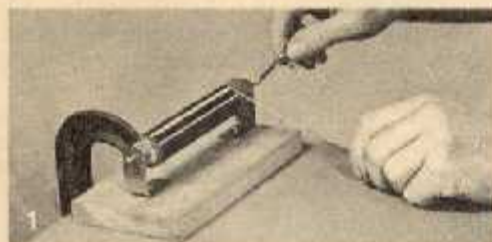
Winding the coil. Coil tube, with its wooden center core, revolves when the handle is turned.