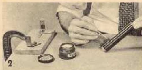
After the ends of the coil are made secure, apply a thin coat of shellac to the entire surface.