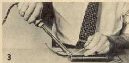
Carefully solder a wire lead to each end of the coil. Use No. 18 or 20 insulated flexible wire.