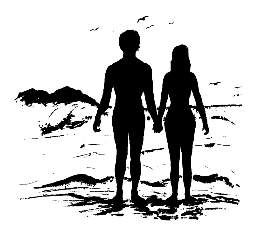
Fig. 12, MALE AND FEMALE FIGURE CONTRASTS

female, the mass difference of shoulders and hips shows that above the waist the male is female polarity and the female is male polarity; so also, in contrast to this, below the waist the male body is of male positive projective polarity and the female is of female negative receptive polarity. (Fig. 12)