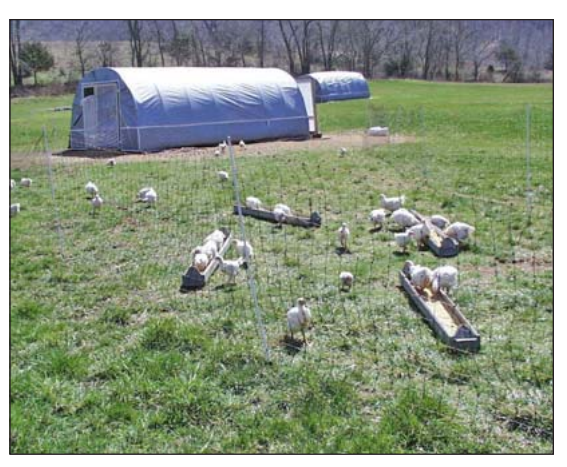
Alternative poultry production usually includes outdoor access.

A lot of information is available on environmental control in conventional poultry production. This publication, however, focuses on alternative production, for which