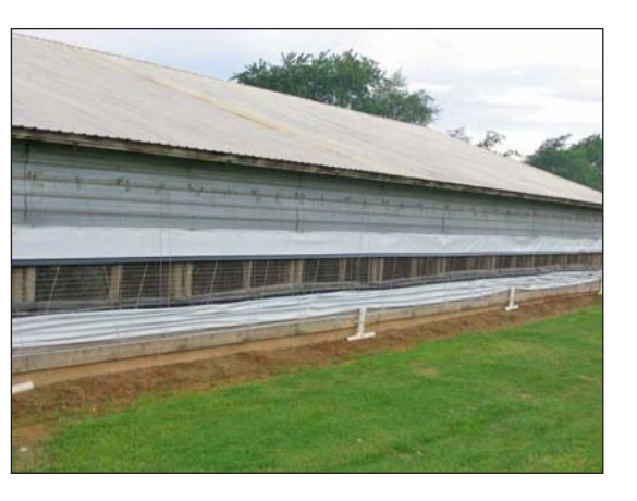
Curtains can be lowered to provide natural ven-tilation.

In mechanical ventilation, positive and negative pressure systems use fans to direct air into the house (positive) or exhaust air from the house (negative). The negative pressure system is most common and controls the air inlet to help mix the incoming fresh air with the air in the house. (1) Mechanical ventilation is less appropriate for freerange houses because the doorways must be closed to maintain "static pressure." For more information see Appendix 1 : Mechanical Ventilation .