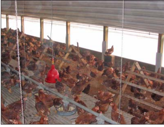
The indoor area is just as important as the outdoor area in free-range poultry production.

tion on our sustainable agriculture projects.