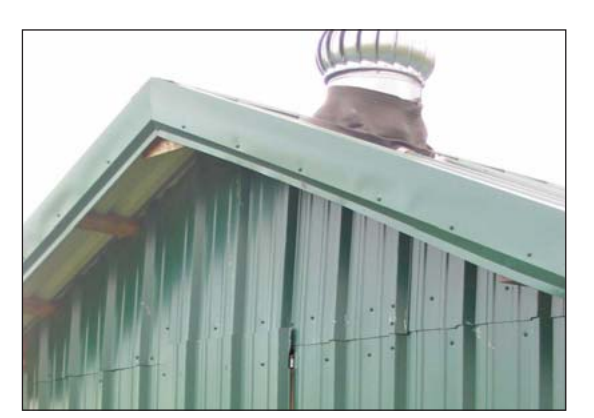
Fans can help exhaust air and moisture out of a house.