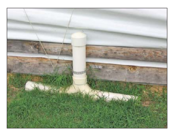
PVC pipes with the bait placed inside can be indoors and outdoors. Stations help prevent nontarget animal from accessing bait.

In addition to outdoor access, an appropriate indoor environment is important for birds in alternative poultry production. Attention to good ventilation, proper lighting, litter and air quality will help maintain performance while providing good welfare.