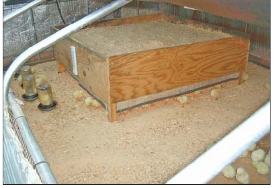
A hover used in a field pen.