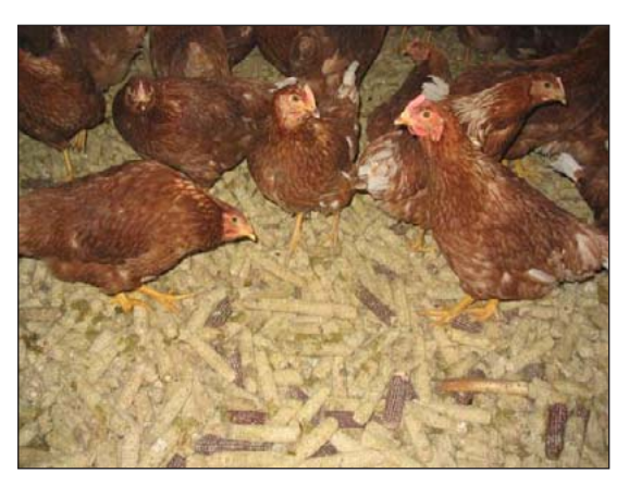
Corn cob litter.

Litter management is very important in most poultry production systems. Floors in poultry houses are usually concrete, wood, or earthen, and litter is used to cover the floor. Litter dilutes manure and absorbs moisture, provides cushioning and insulation for the birds, and captures nutrients for spreading where desired outside. Litter is also a medium for birds to scratch and is important for welfare. Birds are also raised on slat flooring through which the droppings fall into a pit below and are later removed. Keeping droppings dry will reduce odors and flies.