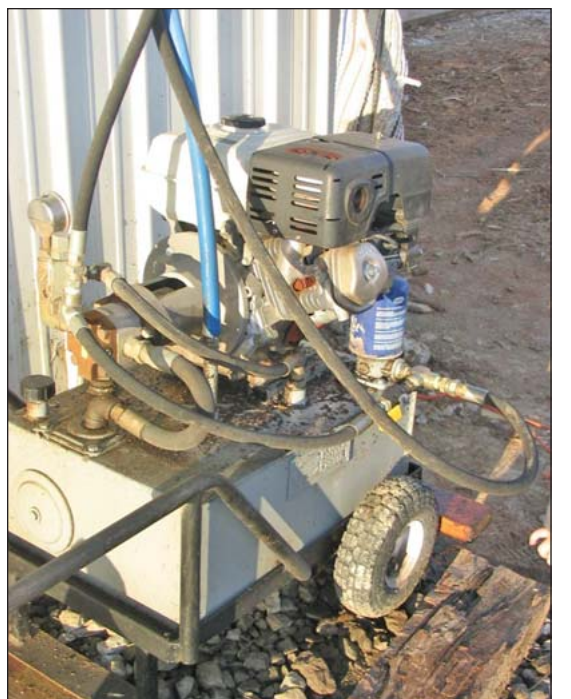
A gas-powered hydraulic motor that augers feed in a house without electricity.

For information on small-scale housing, design, materials, construction plans, see ATTRA's Range Poultry Housing. For information on waterers, feeders, fencing, roosts, and nestboxes, see ATTRA's Poultry: Equipment for Alternative Production. The conventional poultry industry has extensive information on large-scale housing, environmental control, and equipment that can be used for large-scale free-range or cage-free production. See Commercial Chicken Production Manual (1) or Extension materials. Detailed information on ventilation, lighting, and other types of environmental control are available on the University of Georgia's (2) Poultry House Environmental Control Website at www.poultryventilation.com.