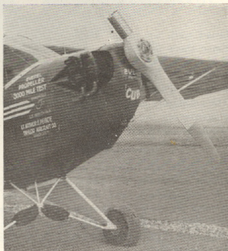
Everel propeller used on a 3000-mile test flight in a Taylor "Cub"

The Everel propeller is of the automatic variable pitch type, this feature being obtained by means of an axis ( B-B in figure 1) within the hub about which the